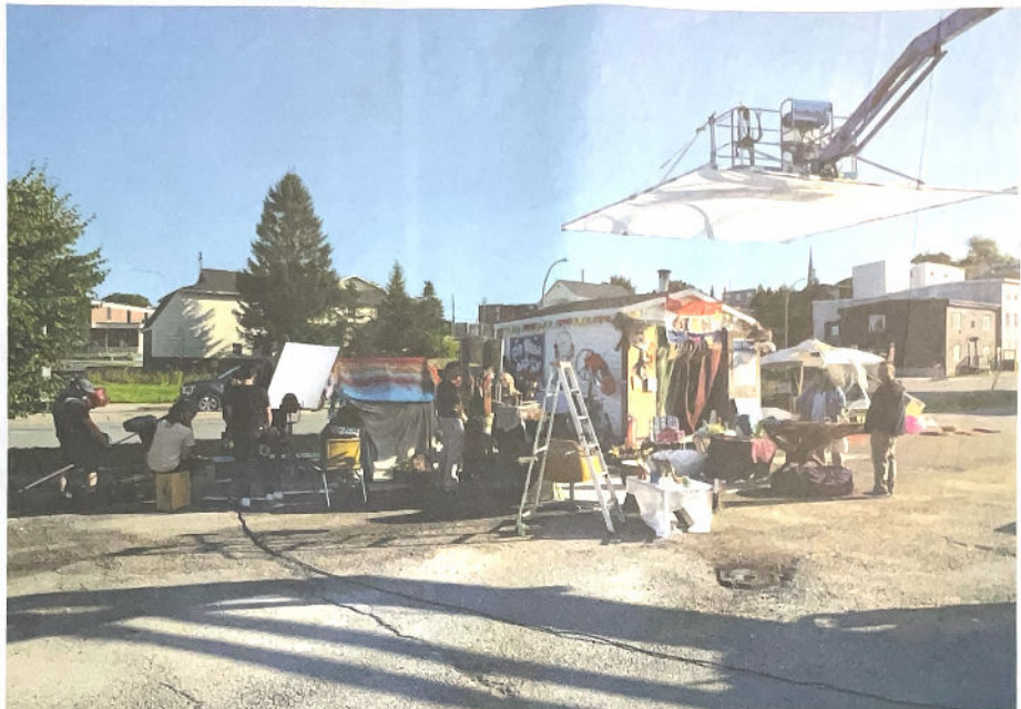
The crew of Saint John-based film production Car Wash Wars is seen on the last day of shooting on Haymarket Square in August. The series debuts Feb. 7.