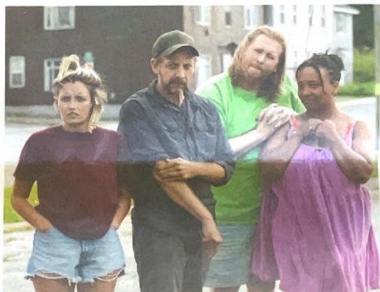
A five-episode TV comedy on Bell Fibe TV1, Car Wash Wars presents "an absurd yet authentic version of Saint John," according to a press release. The series debuts Feb. 7.