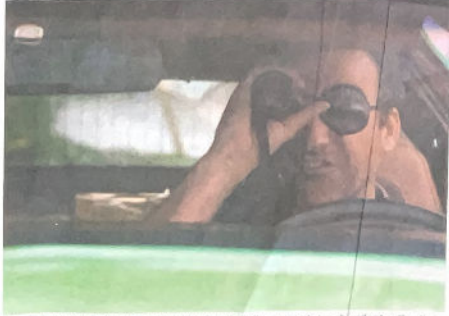
A five-episode TV comedy on Bell Fibe TV1, Car Wash Wars presents "an absurd yet authentic version" of Saint John, according to a press release. The series debuts Feb. 7.